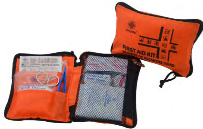
GK - 01039