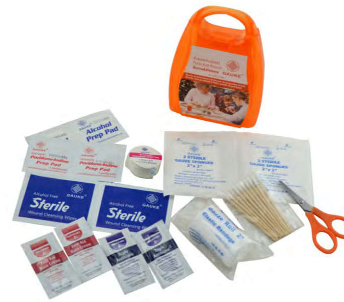
GK - 01006