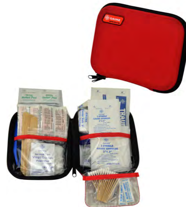
GK - 01045