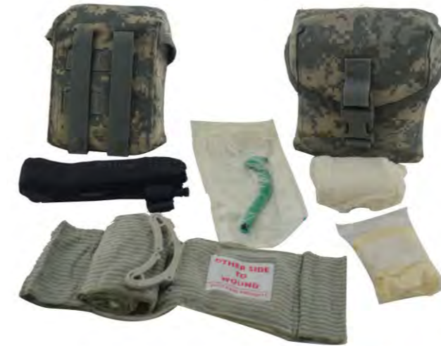
GK - 01050