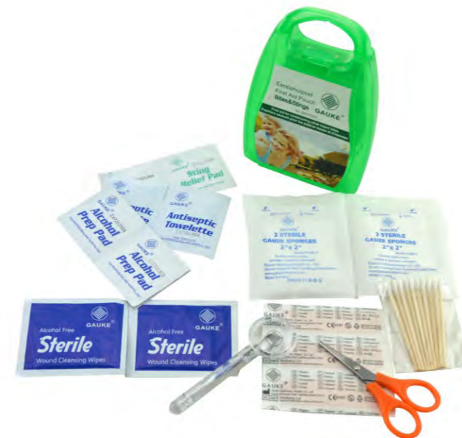
GK - 01003