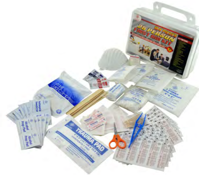
GK - 01020