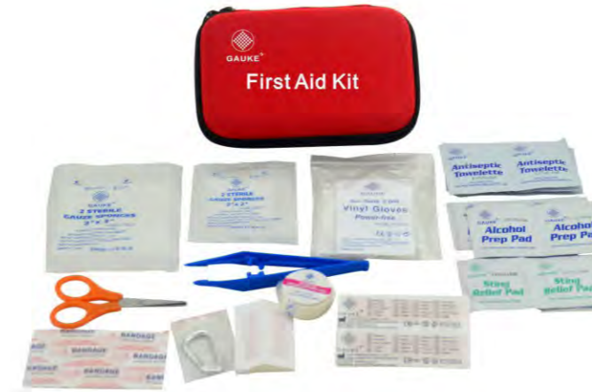
GK - 01044