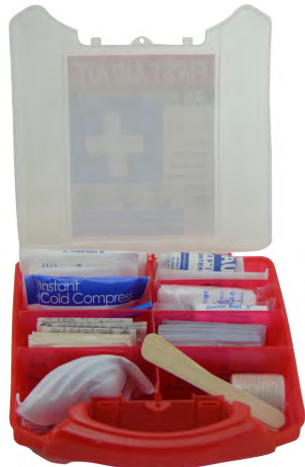
GK - 01012