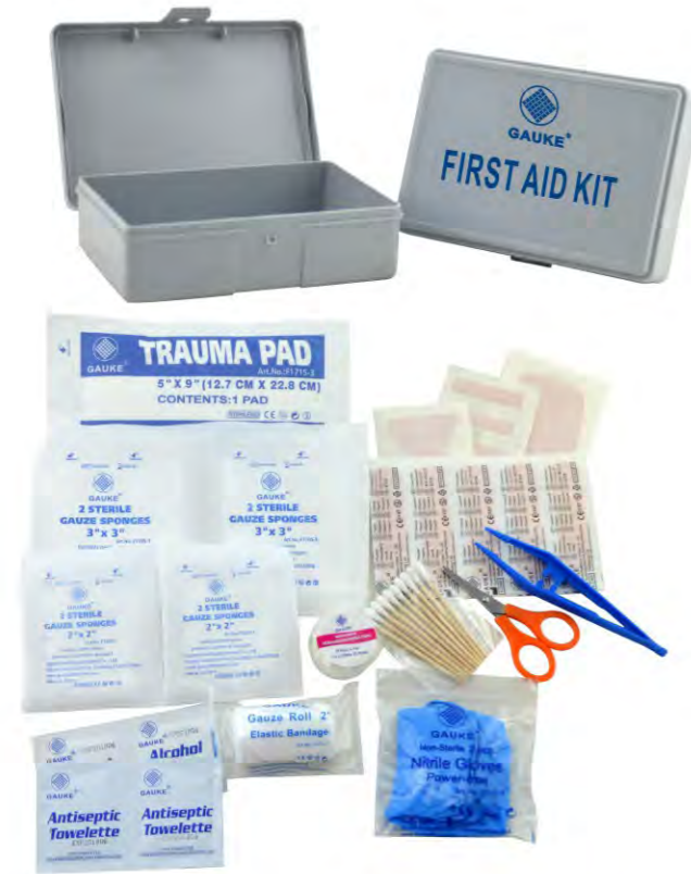
GK - 01028