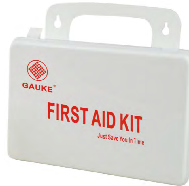
GK - 01019