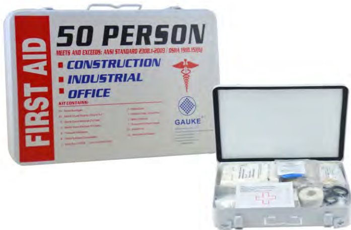
GK - 01035