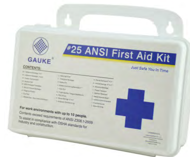
GK - 01016