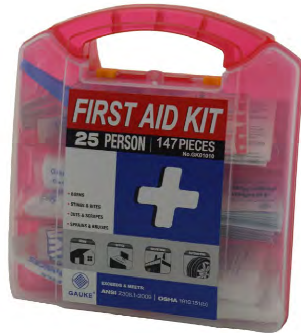
GK - 01010