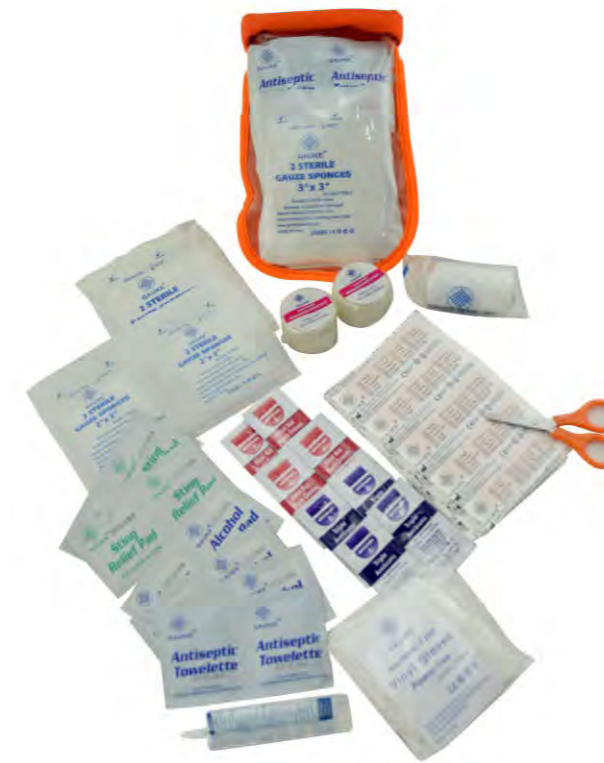
GK - 01038