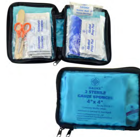
GK - 01037