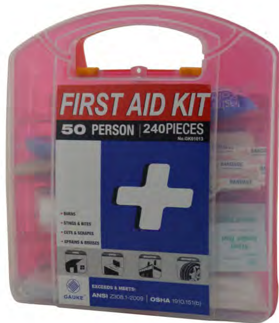
GK - 01013