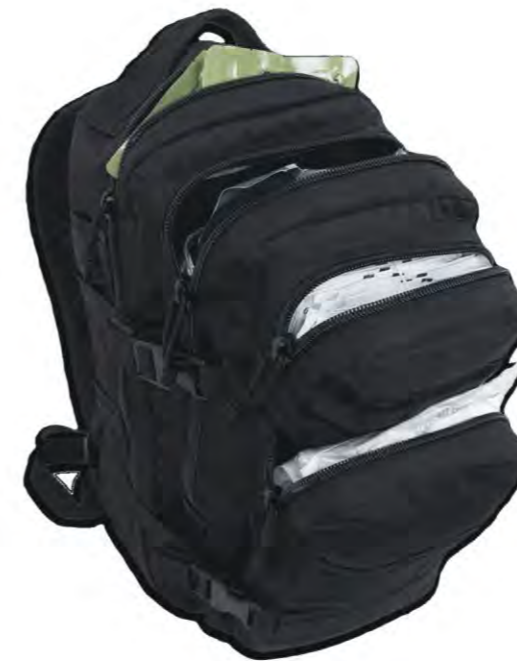
GK - 01051