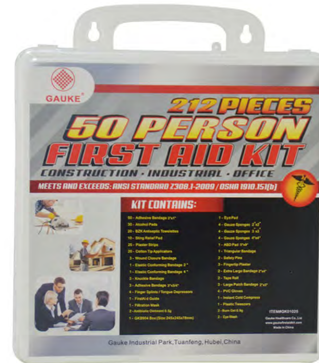
GK - 01025