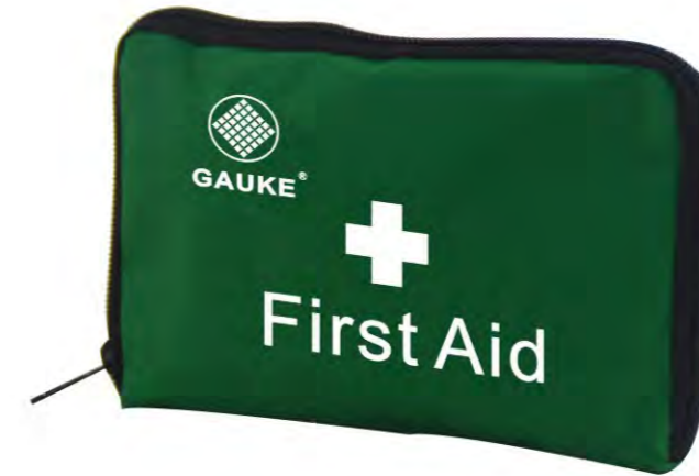
GK - 01036