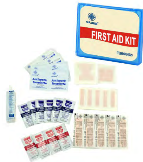
GK - 01029