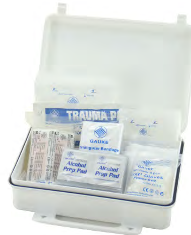
GK - 01022