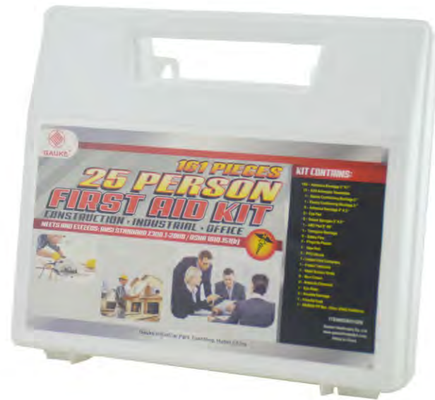
GK - 01026