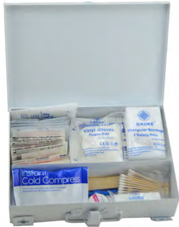
GK - 01033