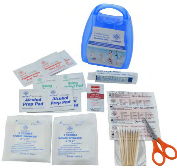
GK - 01005