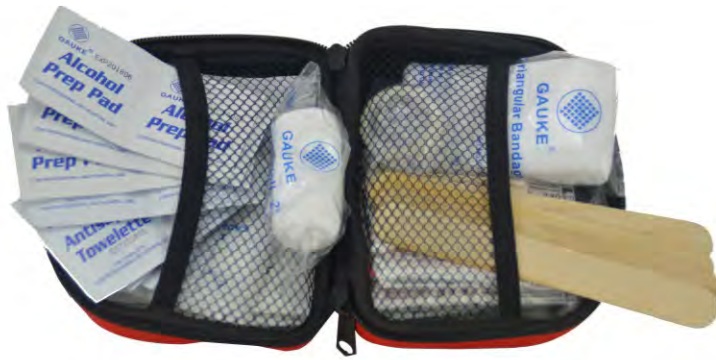
GK - 01046