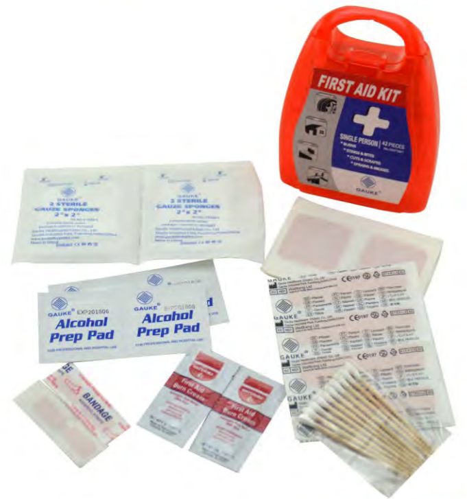
GK - 01001