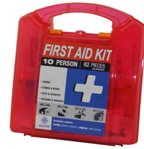
GK - 01007