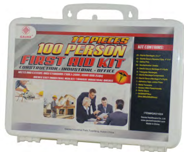
GK - 01024