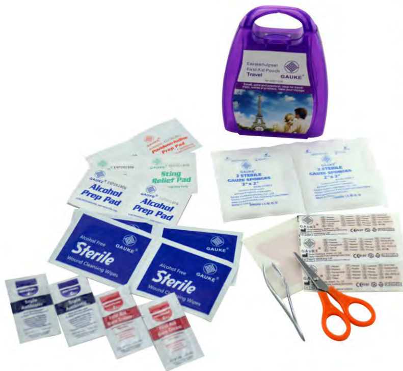
GK - 01002