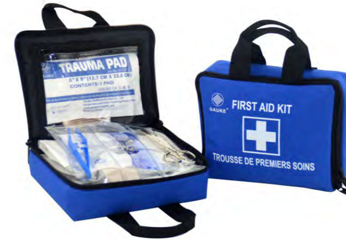
GK - 01041