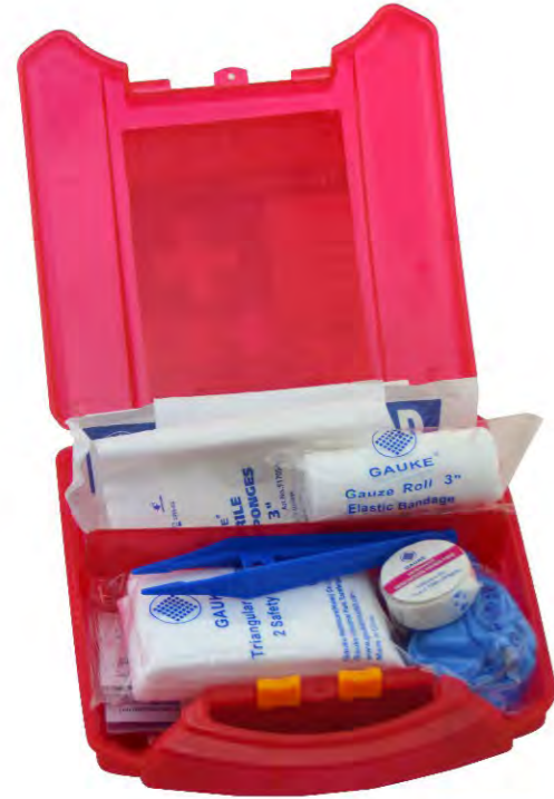
GK - 01009