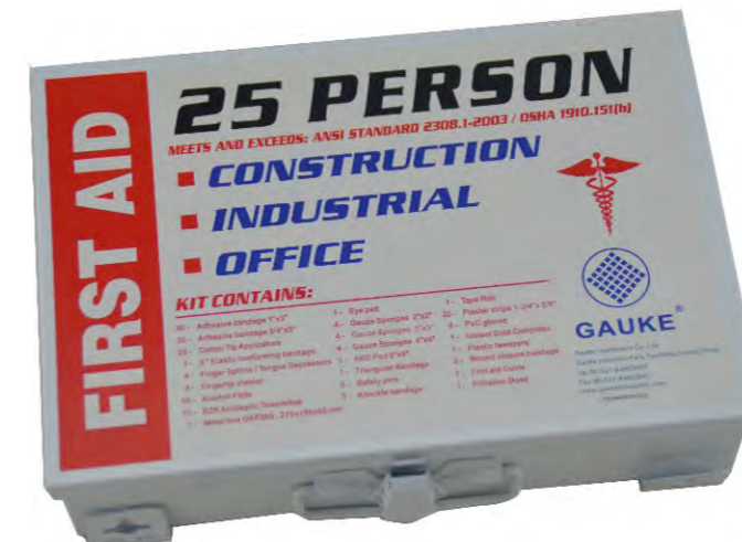
GK - 01032