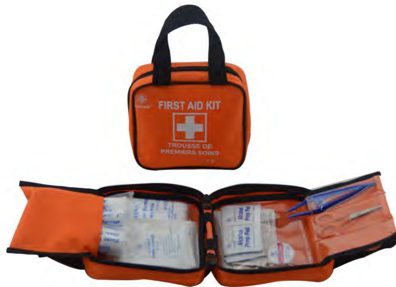
GK - 01040