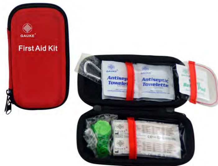
GK - 01043