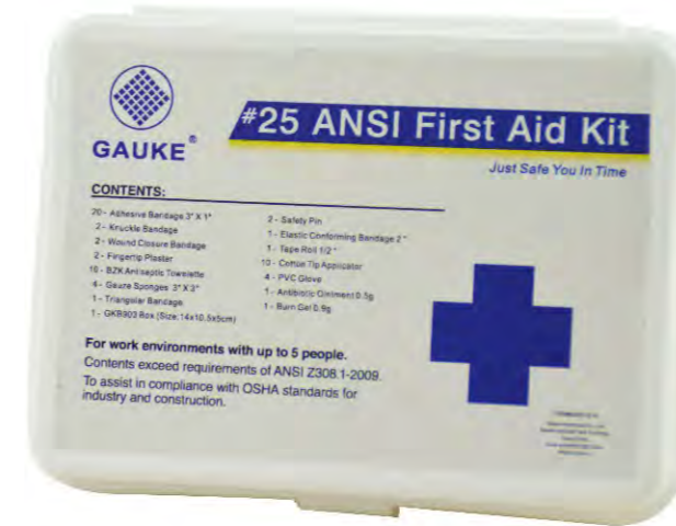
GK - 01014