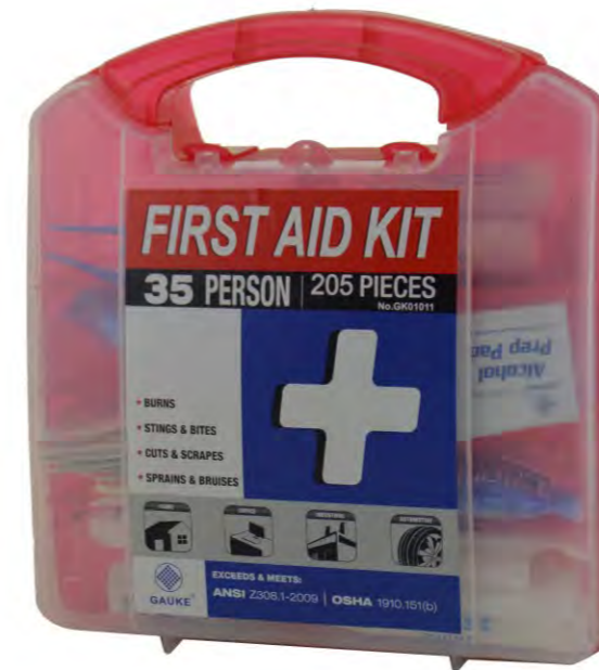
GK - 01011