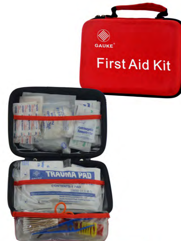
GK - 01048