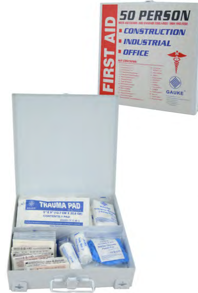
GK - 01034