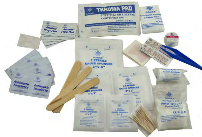
GK - 01042