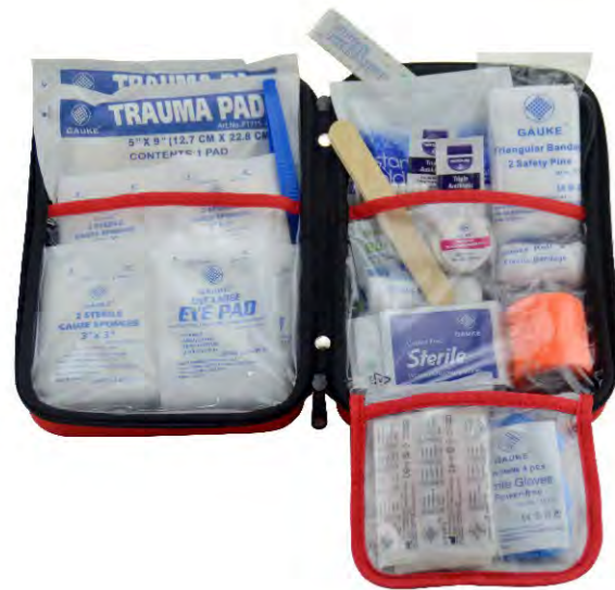
GK - 01049