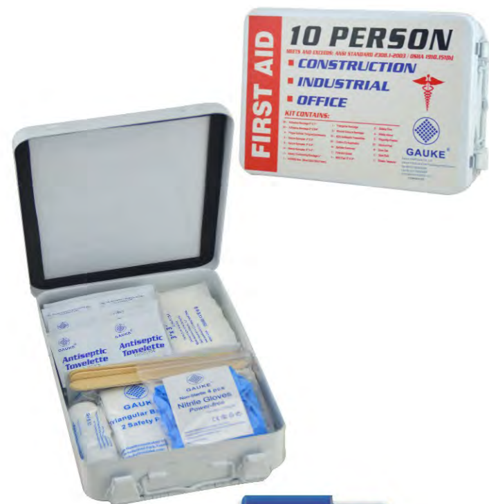
GK - 01030