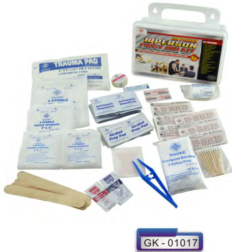
GK - 01017