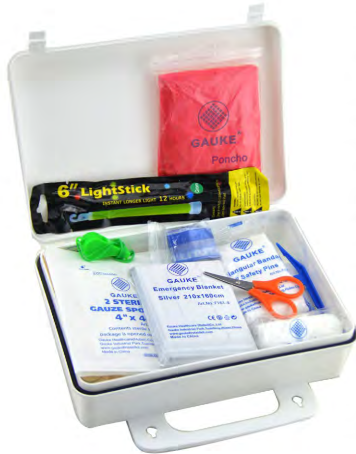
GK - 01023