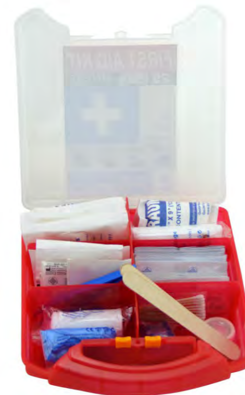
GK - 01008