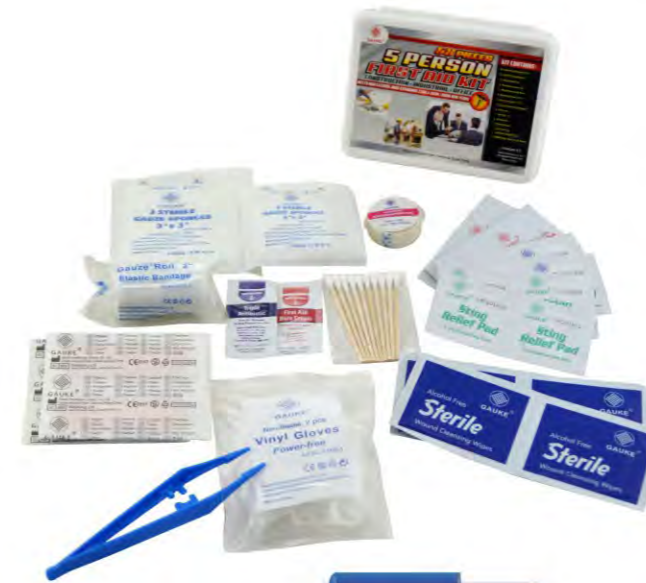
GK - 01015