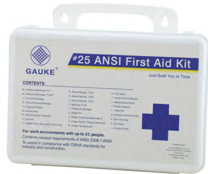
GK - 01021