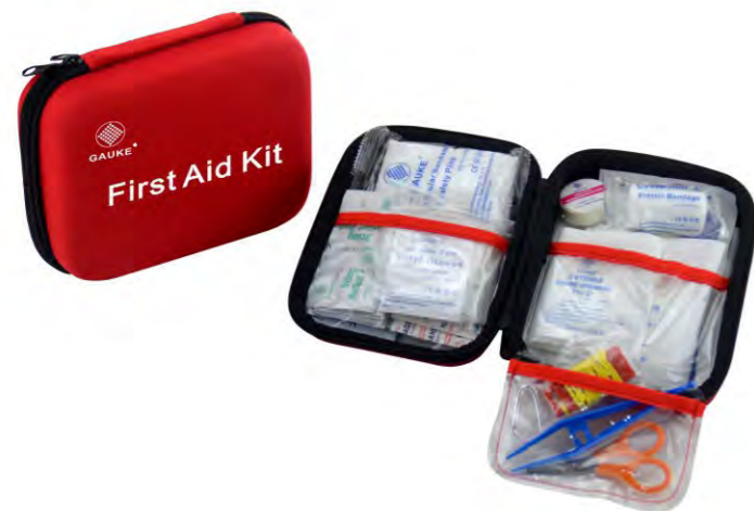
GK - 01047