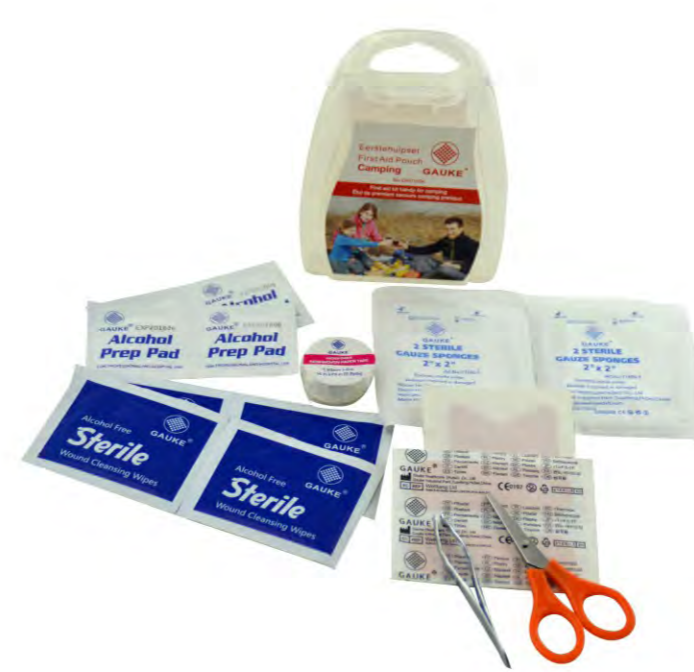
GK - 01004